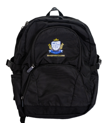
College Backpack Various sizes available Compulsory