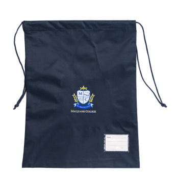
College Library Bag Optional