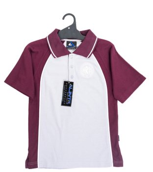
HRIS Sport Shirt Optional