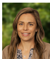
Leigh Zenith 3-6 Library