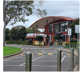
Ring Road Drop-off & Pick-up Area