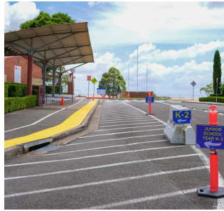
Drop-off & Pick-up Area Opposite Preschool

In the afternoons, our 3-6 students can be collected from the same area around the ring road from 2.40pm onwards.