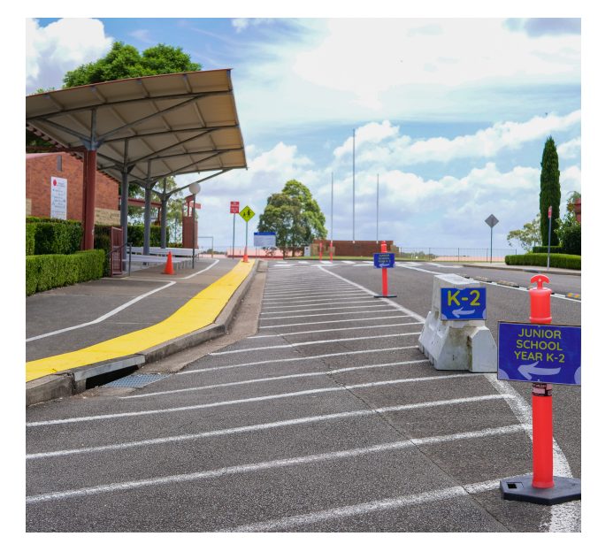
Drop-off & Pick-up Zone (Opposite Preschool)

We have found that most Kindy parents wish to drive their child to and from school. If you do require bus information, please view the bus timetables on the College website or contact the office.