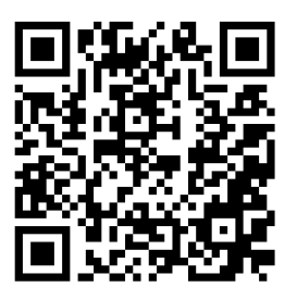
Learning at MC

For more information on how our Kindy friends learn in the classroom, please feel free to visit out website at any time.