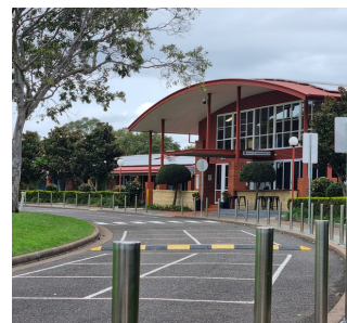
Ring Road Drop-off & Pick-up Area