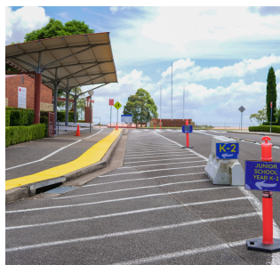
Drop-off & Pick-up Area Opposite Preschool

In the afternoons, our 3-6 students can be collected from the same area around the ring road from 2.40pm onwards.