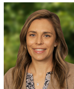
Leigh Zenith 3-6 Library