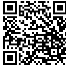
QR Code For more info on our policies and procedures

There are several documents that set out MC expectations for our MC young people. These include uniform, attendance, devices and more. If you would like to read through these documents you will find them on our website. When enrolling at MC, families agree that their young people will meet the expectations set out in these documents. Essentially it means that students will try their best to ensure they behave in a manner that is respectful and supports their own learning and that of others.